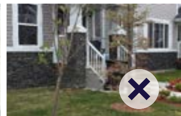
* Poor Health