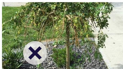
* Grafted Trees